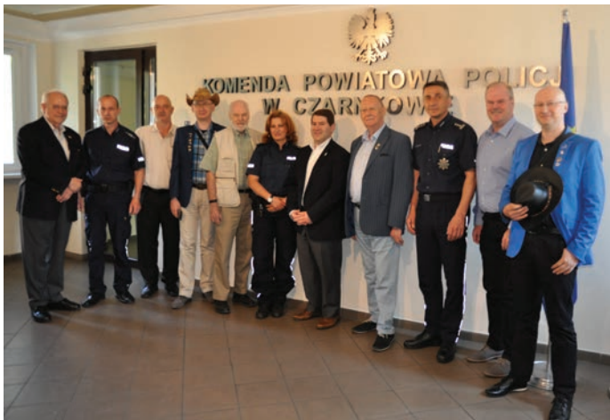
Members of the North American delegation at the Czarnków Police Department.

The conference ended with an interesting discussion, during which members of the North American delegation received a number of questions about the cooperation of law enforcement with representatives of education, probation, and social services in counteracting domestic violence and addressing other crime problems.