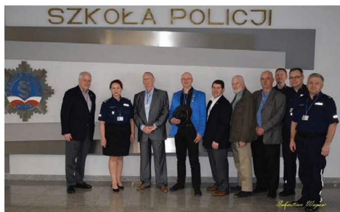
Members of the North American delegation at the Piła Police School.