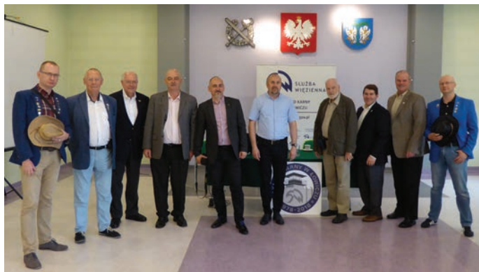
North American delegation with hosts at the prison at Łowicz.

This facility, like the others we have toured during past visits, placed a high priority on inmate programs. Inmates are carefully classified and housed in units identified as open, semi-open, or closed. This terminology closely corresponds to our housing descriptions of minimum, medium, and maximum. Programs vary based on housing assignment. Many inmates in "open" housing are in programs that allow them to work for private employers outside the facility and return at the end of each day. Another interesting feature of the facility is the "family room." Inmates that demonstrate good behavior and meet other criteria are allowed to spend a weekend with family members in this housing assignment within the facility.