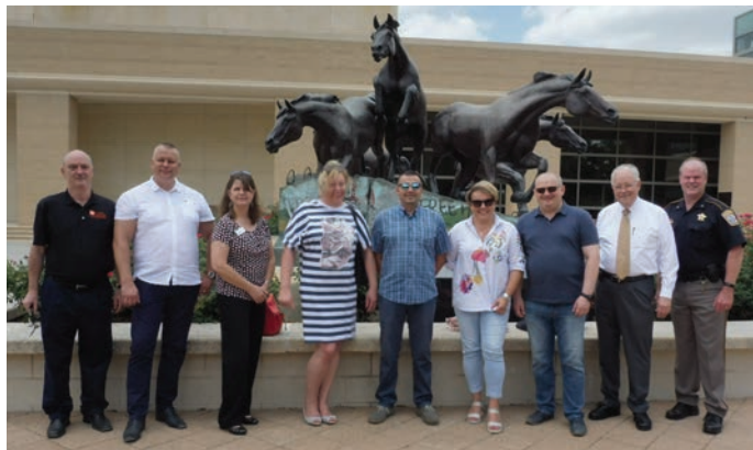
Members of the Polish delegation with Texas hosts.