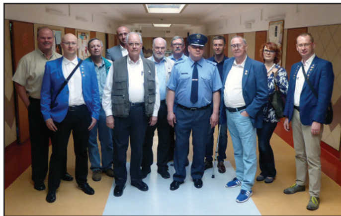
Members of the North American Delegation with Polish hosts at the prison at Ustka.