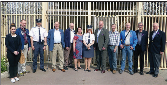
Members of the North American Delegation with Polish hosts at the prison in Koszalin.